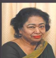
Shakuntala Devi Human Computer