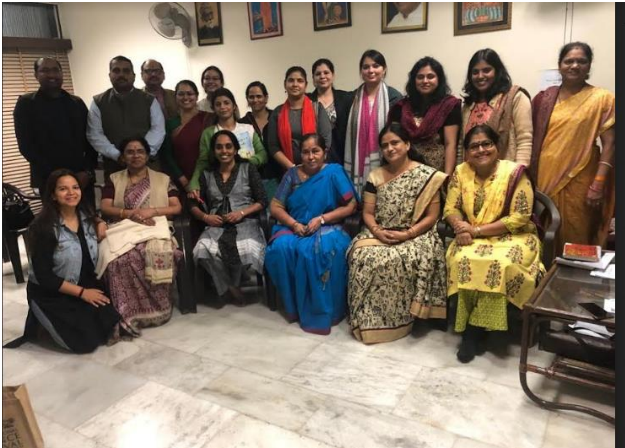
Pic- 23 November 2019