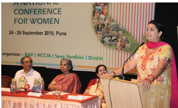
National Conference: We Meet 2010