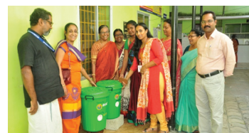
Supplying Bio-Bins for depositing bio-waste in the Primary Health Centre, Kothad (Kerala)