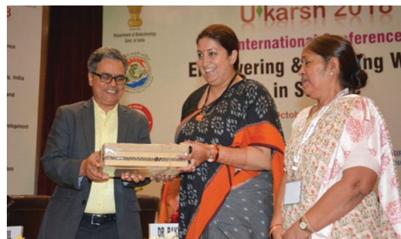
National Conference: Utkarsh 2018