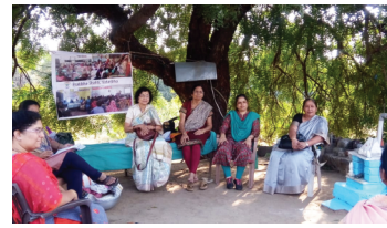
Village Adoption Program