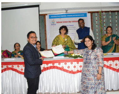
National Science Day Program: Prize distribution for project competition