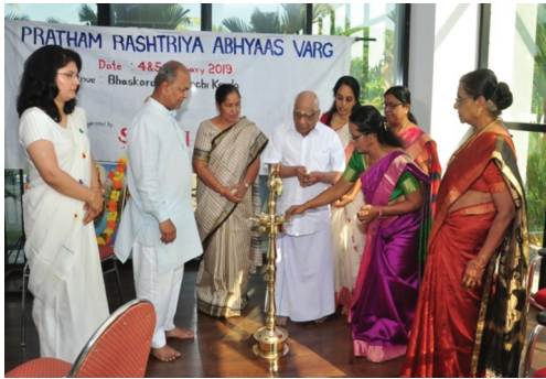
SHAKTI - Rashtreeya Abhyas Varga 2019