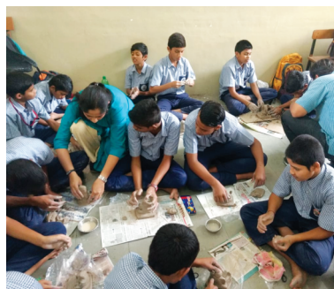
Eco Friendly Ganesh Idol Making Workshop