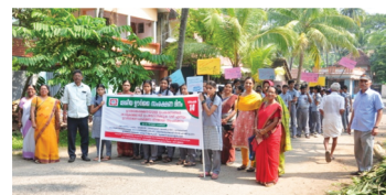
Environment Protection Rally