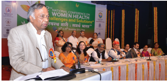
National Conference Women Health-Challenges and Solutions 2015