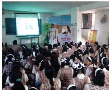
Yuva Shakti Abhiyan